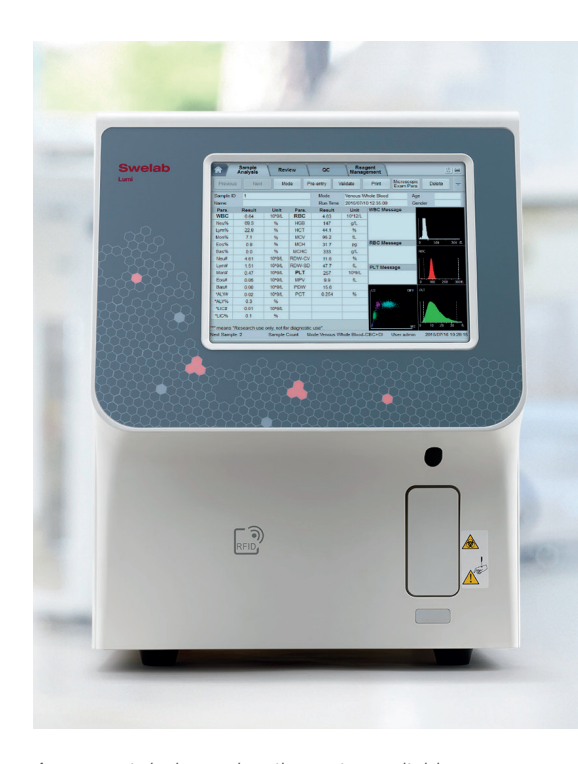
A compact design makes the system suitable for confined spaces.

Swelab Lumi brings you the opportunity to leverage high-quality diagnostics, while keeping costs to a minimum.