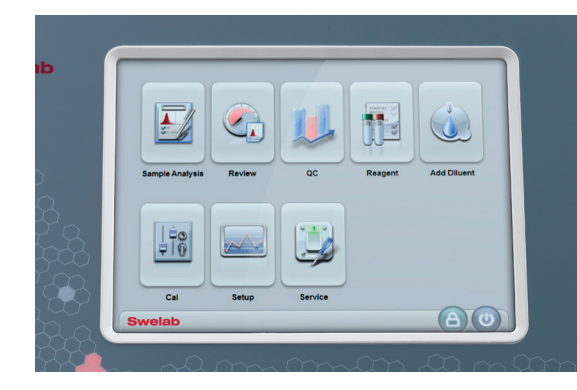
Easy-to-use display simplifies system handling.

Swelab Lumi is designed to simplify work processes and give users better control of sample results and patient records. The intuitive user interface promotes smooth operation, with simple-to-understand and easy-to-navigate menus. Instrument features such as the open probe design and the selected leaning angle of the screen contribute to an ergonomic working environment.